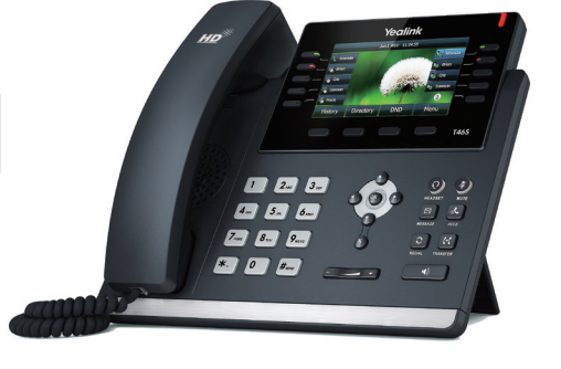
HD Voice Opus Codec